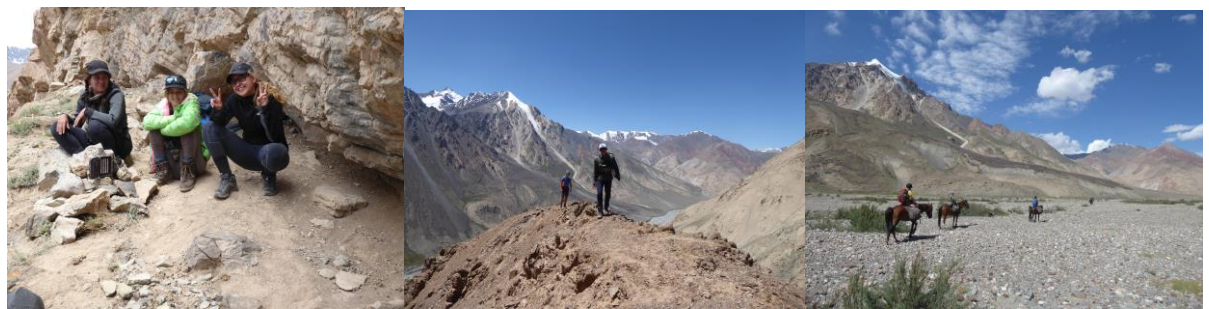
Pictures 17 – Set up of Kizil Keregue camera trap, transect on the crest of Kirk Choro and transport from one camp to another

This year, only few of the camera traps had empty batteries or a full SD card when we controlled it.