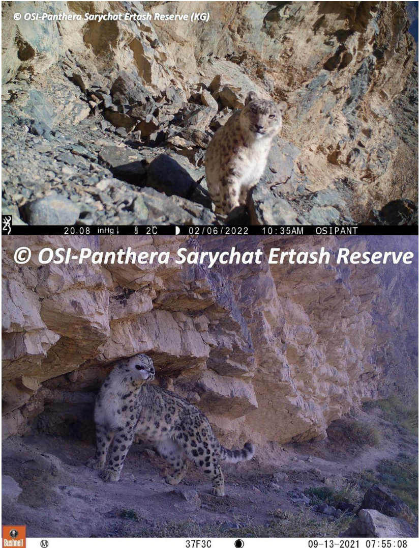
Pictures 6 - Snow leopard adult in Kitchi Uch baital and another in Kizil Keregue, by OSI-PANTHERA's camera trap.

- Eighteen feces samples have been gathered for genetic analyses during the July expedition and twenty-seven during August expedition. Analyses of these samples will lead to an article later.