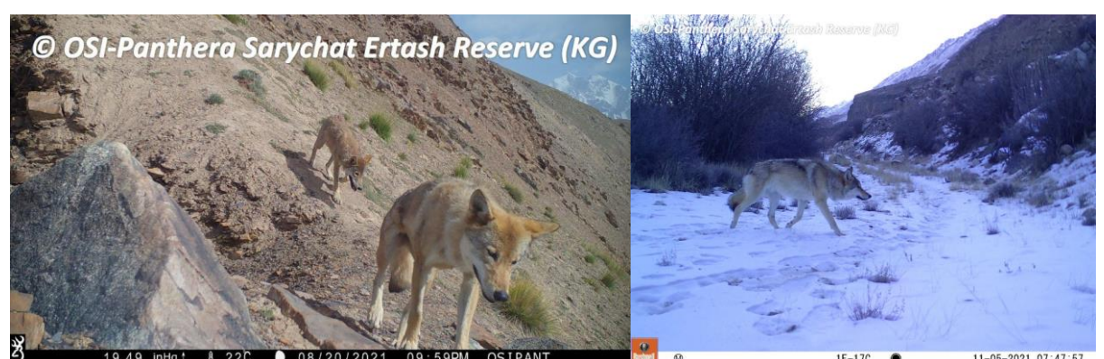
Pictures 10 – Wolves on Ortho Bordou crest and one wolf in Solomo area, pictured by OSI-Panthera camera traps