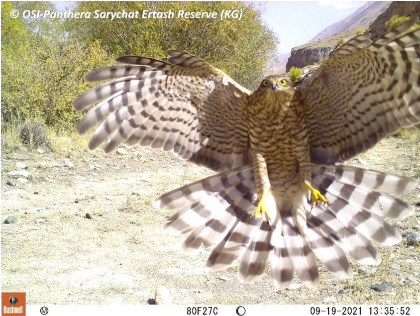
BiothellØ80F27CØ09–19–202113:35:52Picture 4 – Eurasian Saprrowhawk female on OSI-Panthera's camera trap