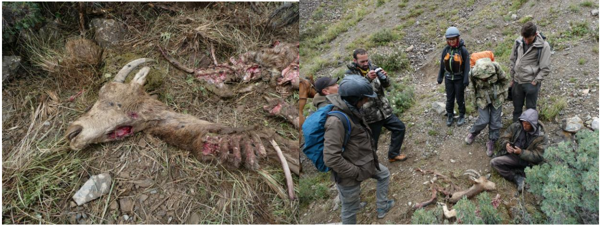
Pictures 11 – Female ibex found freshly killed, pictures by Anne-Lise CABANAT

A female was found freshly killed (few hours before) probably by a snow leopard (there were fang marks in the neck) and eaten by a bear (3 really fresh fecal of bear) in Sirdibai 2 the 8<sup>th</sup> of August 2022.