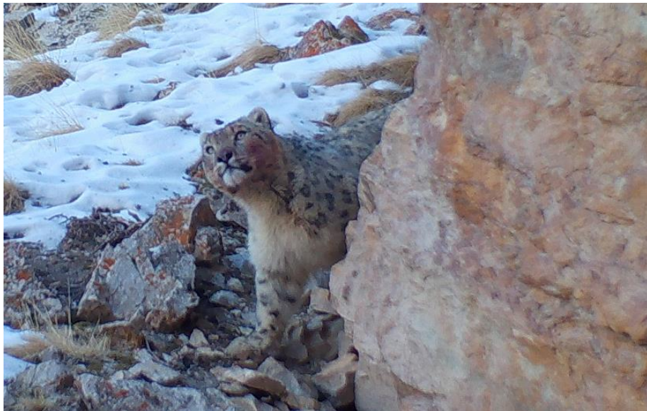
Picture 23 – Individual with blood on the face, pictured by OSI-Panthera camera trap.