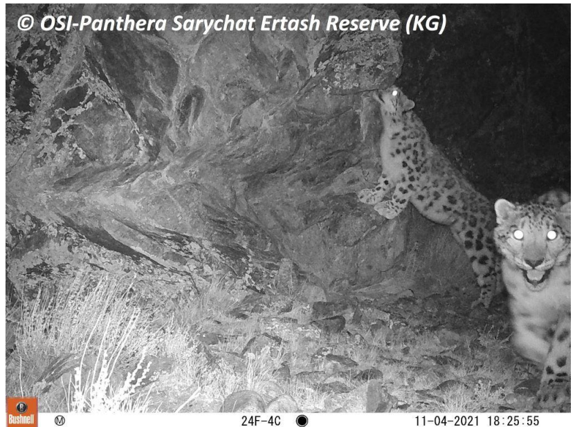
Picture 20 – Female and subadult in Tchong Sary Etchki, pictured by OSI-Panthera camera trap.