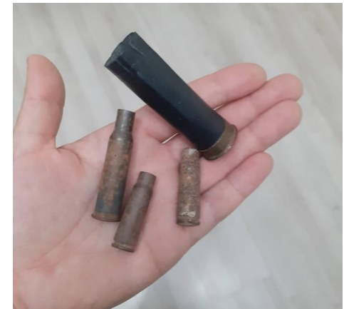
Picture 28 – 3 old rifle cartridges and 1 shotgun shell found in area Solomo

During our transects we still regularly find old shell casings, this year around Atcha and Sirdibay. We also found a rifle cartridge (which seems to be fresher) in the Solomo camp.