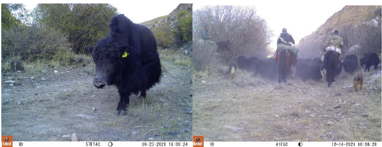
Pictures 33 – Yacks and shepherds with a weapon photographed by OSI-Pantheras' camera traps