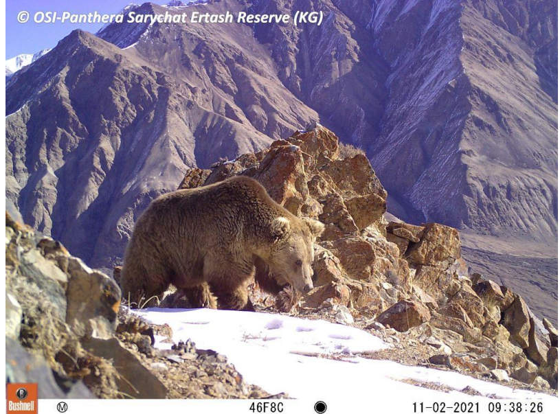
Picture 9 – Tien Shan brown bear in Bir baital crest, pictured by OSI-Panthera camera trap

An estimation of the population based only on camera trap pictures seems difficult to realize at this time because of a lack of experience about this species, so any specialized organization is welcome if they are interested by our data collected for many years.