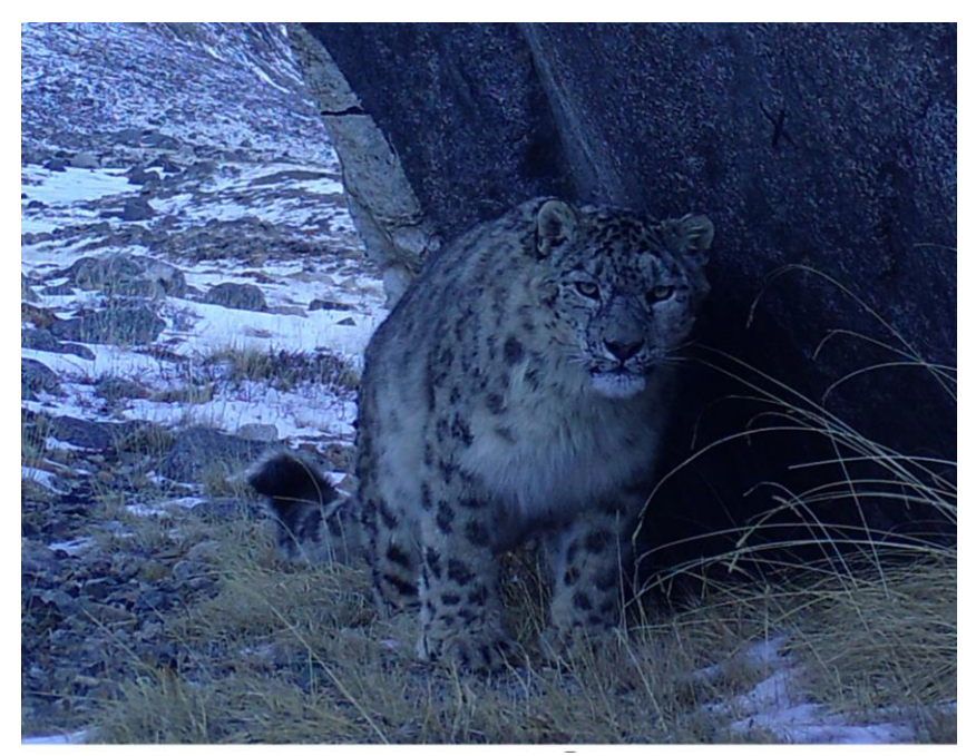
Picture 19 – Individual that have a scar on the face, pictured by OSI-Panthera camera trap.

This camera trap photographed wolf in November 2021, foxes, marmot, argali and snow leopard (in April 2022 and one with a big scar on the face in December 2021