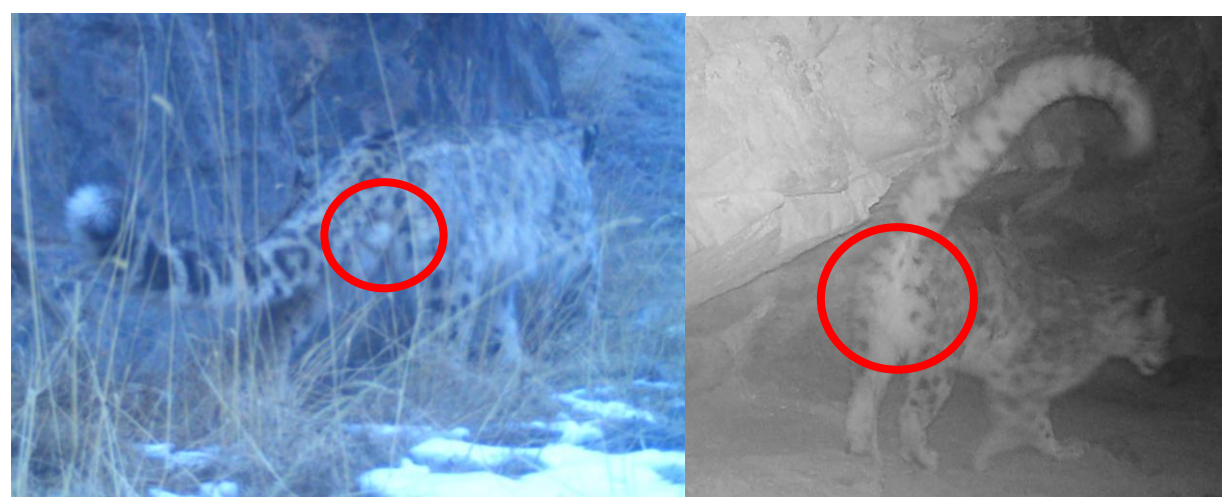
Pictures 25 – Aiperi a male with testes (left) and Elmikau a female (right)

Gender determination was sometimes possible based on the presence of testes, the presence of cubs and mating pictures.