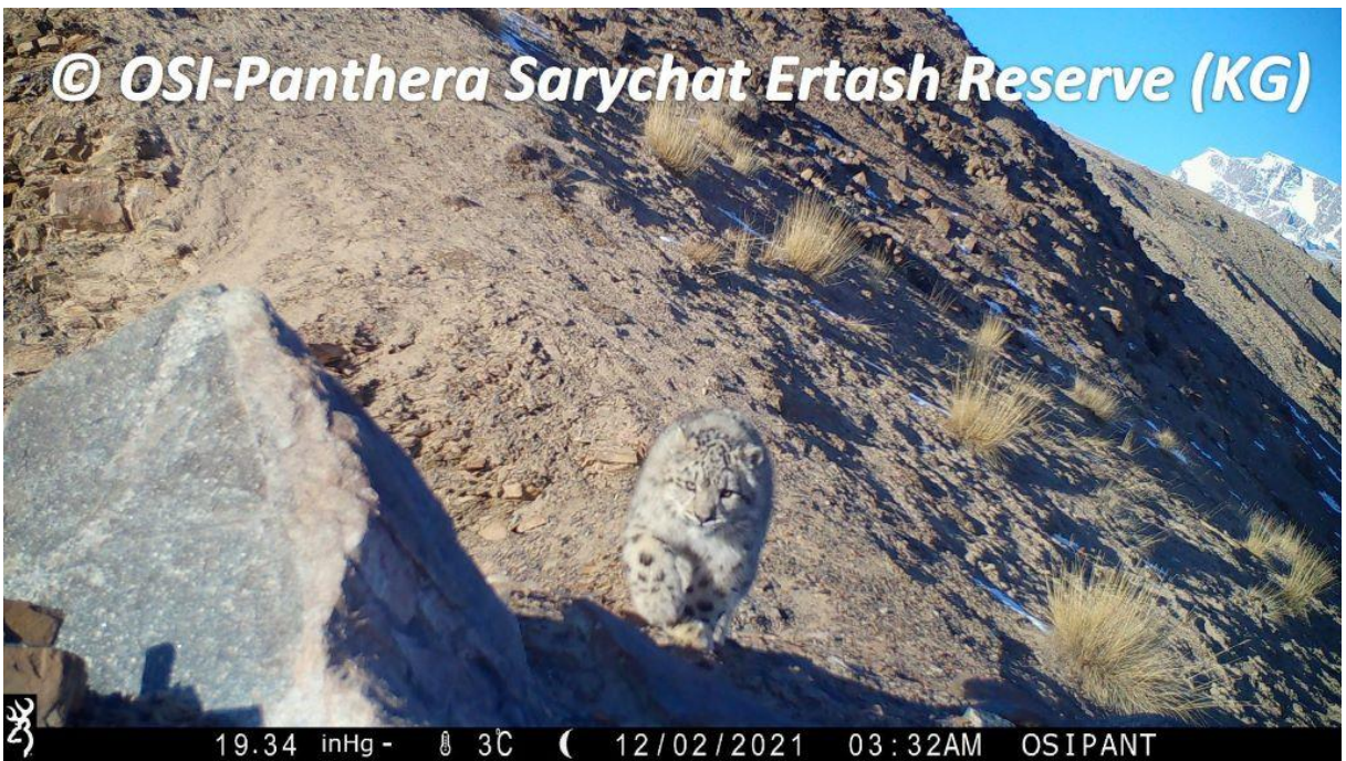
Cub of few months on Ortho Bordou crest, by OSI-Panthera camera trap