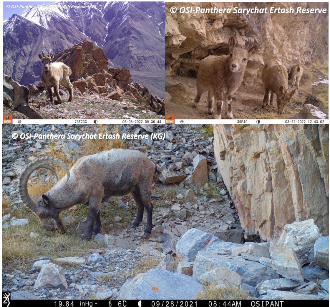
Pictures 12 - Female Siberian ibex in Bir baital, kid in Kizil Kérégué, female and a male in Bich Jilga, pictured by OSI-PANTHERA's camera traps

Differentiating females and kids can sometimes be tricky. Hence, female counting might include a few kids.