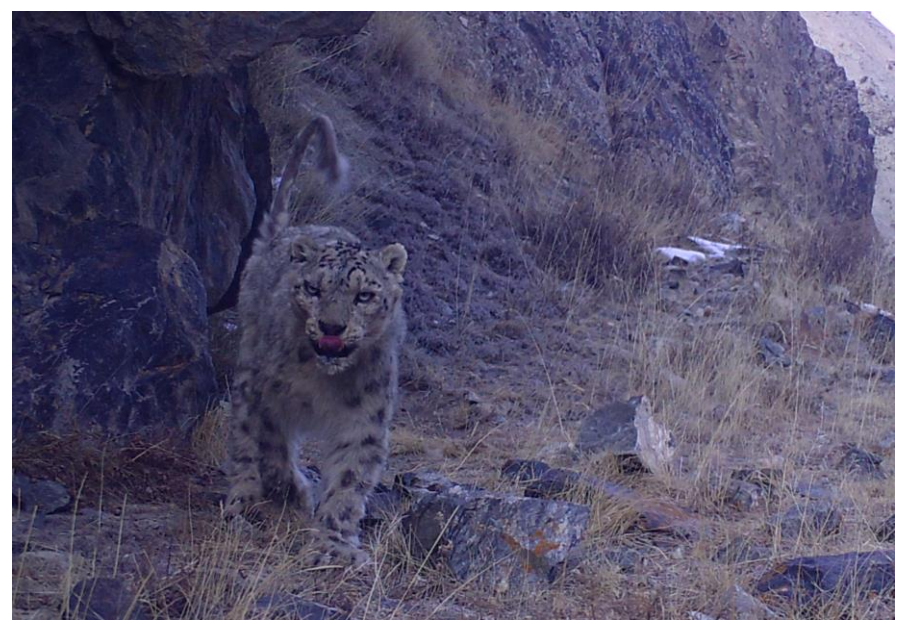
Picture 18 – Individual that seems to have fight (no fur on the tail, scar on the face, etc.), pictured by OSI-Panthera camera trap.