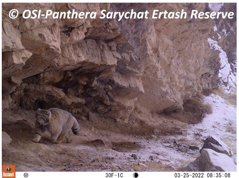
Picture 7 – Pallas' cat in Kizil Kérégué, by OSI-PANTHERA's camera trap.

We shared this data with the Pallas's Cat Working Group .