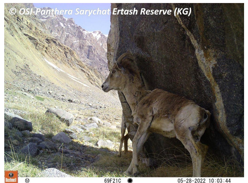
Picture 14 – Tien Shan argali female in Tchong Bordou, pictured by OSI-Panthera camera trap.

Differentiating females and kids can sometimes be tricky. Hence, female counting might include a few kids. Moreover, in July and August it is easier to observe females and kids that are lower in the valleys than males.