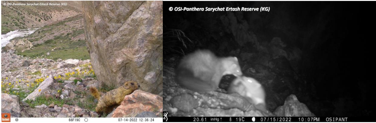
Pictures 15 — Marmot in Jaman suu and 2 beech martens in Kitchi Uch baital, photographed by OSI-Panthera camera traps