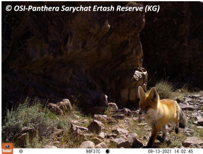
Picture 16 – Red fox in Tchong Sary Etchki, pictured by OSI-Panthera camera trap.