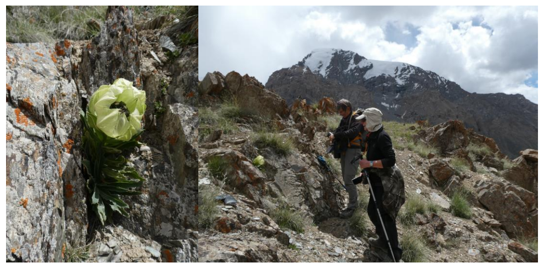
Pictures 35 – Station of Saussurea involucrata in Chong Koilou, by Anne-Lise Cabanat

A station of Saussurea involucrata (red book of protected species in Kyrgyzstan) was registered on a crest of Tchong Koilou.