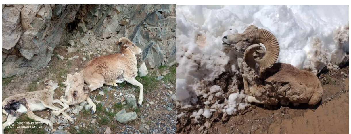
Picture 13 – Argali female and 2 lamb, male freshly dead after heavy snowfall, pictures of rangers.

A lot of livestock (sheep, horses, etc.) died also because of this climate event and we constated many horses (even horses of the reserve) were eating their hairs each other because they were not able to feed.