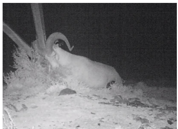
Picture 34 - Argali male found freshly dead because his horns were blocked in the pylone of the electric line in the South of the reserve in June 2016.

Before it was a reserve, the area was used by USSR shepherds, so it seems that most of the wastes, such as metal waste, came from this period. Around camps there are also old metal fences that can be dangerous and act like traps for horses and fauna. In 2016 we discovered a male argali dead because his horns were blocked in a pylone (fences can have the same consequences). There are also wastes left by foreigner's expeditions and by rangers themselves along the years.