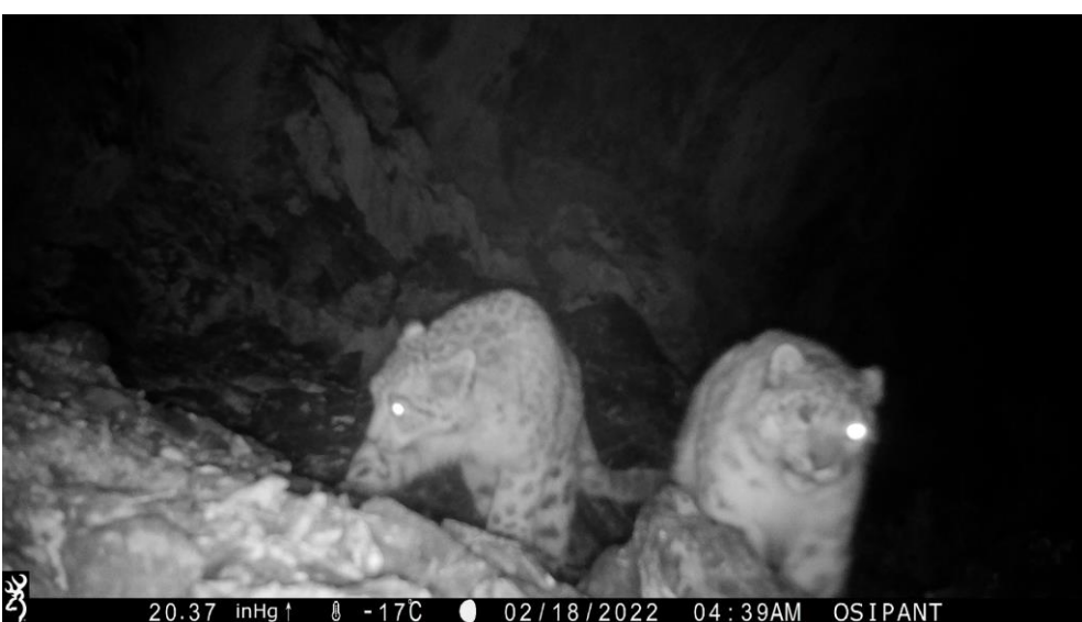
Picture 24 – Two individuals, one individual without right eye, pictured by OSI-Panthera camera trap.

This camera trap monitored beech marten family, ibexes, Chukar partridge, bear, pika, immature bearded vulture, pika and snow leopard (September 2021 a female with minimum 2 cubs, October 2021, a female with 3 cubs in November and December 2021, in February 2022 a female with cubs and 2 adults, one without right eye, March, April, May, June 3 subadults, July 2022).