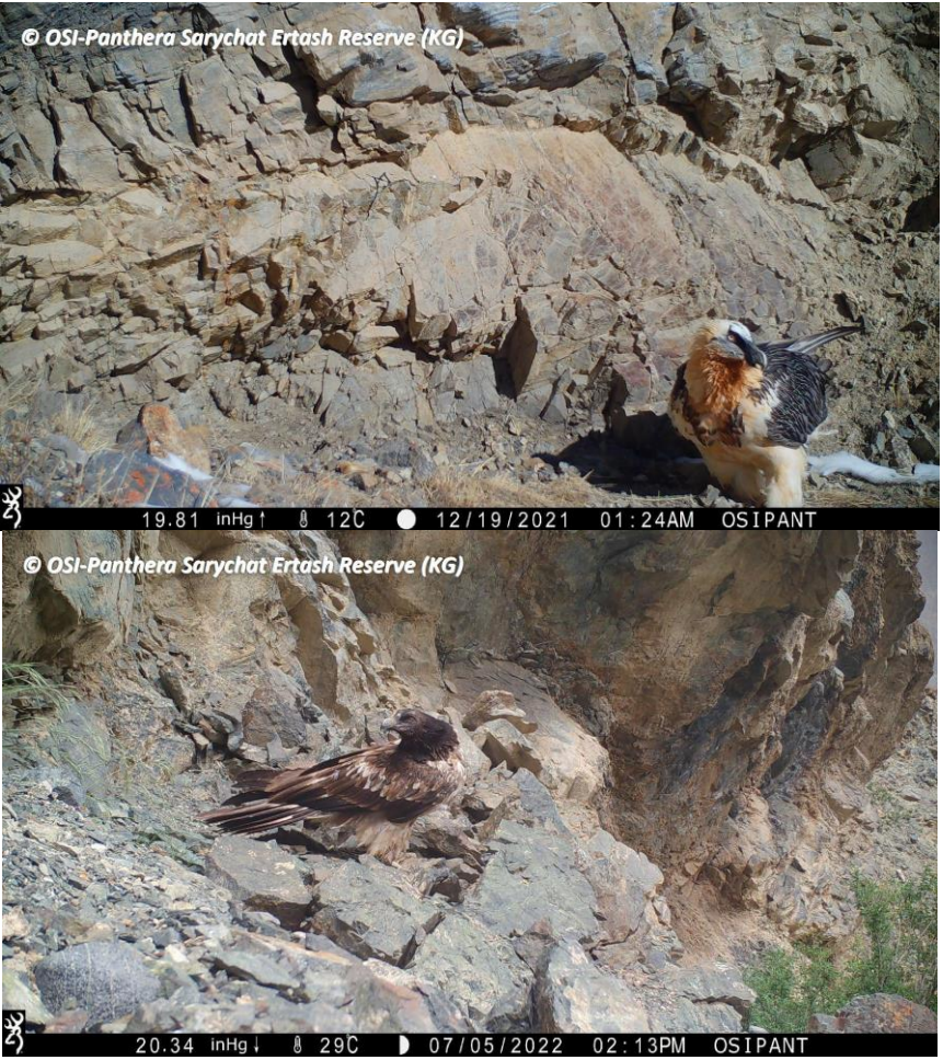
Pictures 3 – Bearded vulture adult and immature one on OSI-Panthera's camera trap

- One Eurasian Sparrowhawk (Accipiter nisus) female was photographed by camera trap in September 2021 in Solomo area.