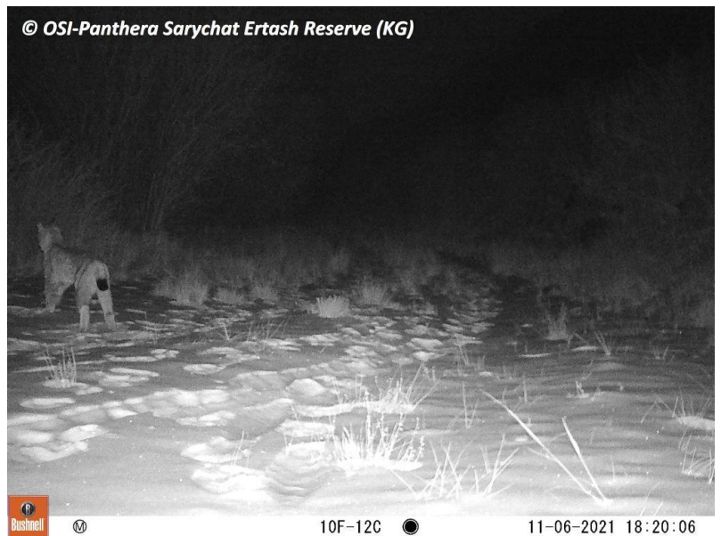
Picture 8 – Turkestan lynx in Solomo area, by OSI-PANTHERA's camera trap.

A lynx was photographed alone in Solomo area in November 2021.