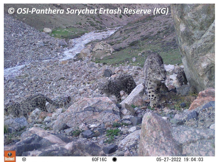
Picture 21 – Female and 3 subadult in Jaman suu, pictured by OSI-Panthera camera trap.

It photographed bear (in July 2022), Pallas cat (in February 2022), wolf (in January 2021, April and May 2022), beech marten, stoat, ibexes, Chukar partridges, foxes, pika, marmot and snow leopard (September and October 2021, November 2021: a female with 3 cubs, an individual alone in November 2021, a female with 3 cubs in February 2022, March and May 2022 including the female with 3 cubs.