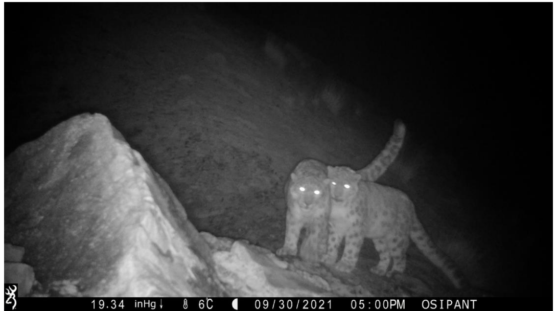
Picture 22 – Mother and subadult, pictured by OSI-Panthera camera trap.

The new camera set up in summer 2021 photographed: wolves (maybe "red" wolves in August 2021), bear (in August 2021), foxes, ibexes, hare, Himalayan snowcocks, pika, beech marten, Chukar partridgs, stoat, marmot and snow leopard (August 2021, September 2021 including a female and a cub few times and another female with a subadult, October, November: including the female with a cub, December 2 individuals together and the female with the cub, February, March, April and July 2022).